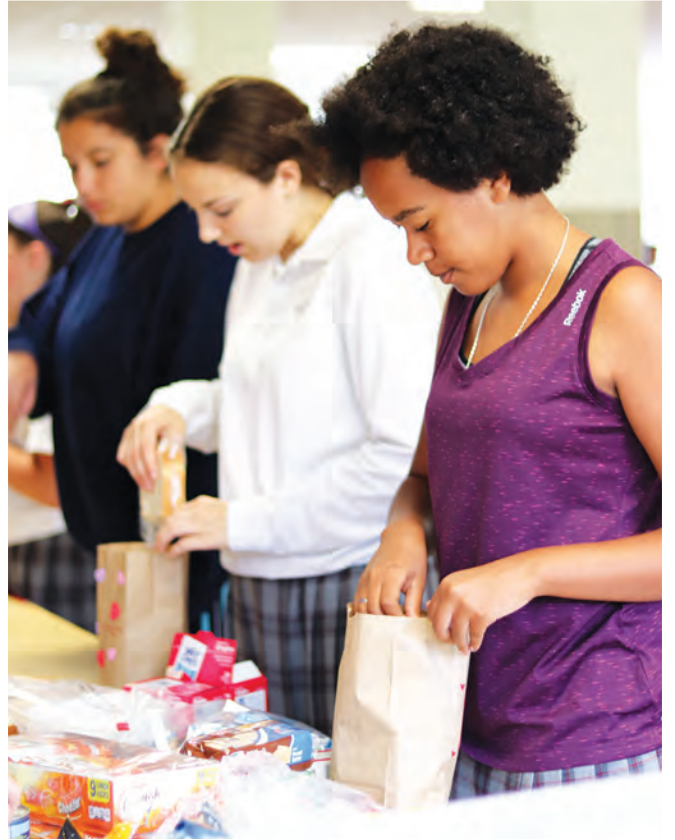
Students (left and above) pack lunches for a New Haven homeless shelter.